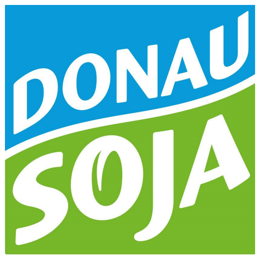
Donau Soja Guidelines