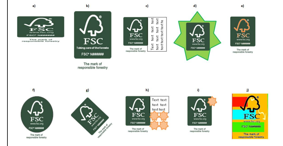
Figure 7: examples of unacceptable uses